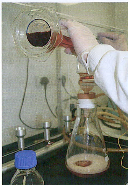
▲ After three days the samples were poured through a 0.8-micron filter

fuel/water ratio 1:1000. After 14 days the fuel was analysed to see how well the products had worked at preventing microbial growth. If they were effective, there ought to be significantly fewer microbes than in the (untreated) control. In both experiments the bottles were stored in the dark, kept warm (28°C), and agitated on a mechanical shaker to replicate the conditions of a fuel tank while under way.