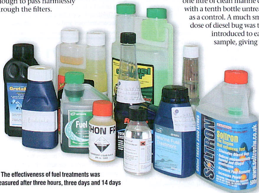
▲ The effectiveness of fuel treatments was measured after three hours, three days and 14 days

For the prevention test , the nine fuel treatments were each added to one litre of clean marine diesel, with a tenth bottle untreated as a control. A much smaller dose of diesel bug was then introduced to each sample, giving a