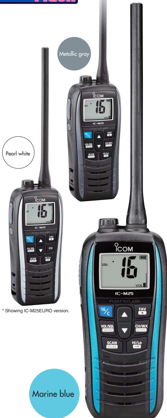
* Showing IC-M25EURO version.

Icom proudly announces the debut of the new entry level marine transceiver IC-M25/EURO. The IC-M25/EURO comes in three color variations (metallic gray, pearl white and marine blue) to add a flair of style making the IC-M25/EURO look good with your boating/fishing fashion or on it's own. The 220g lightweight body makes it the lightest floating marine transceiver available, allowing you a feeling of freedom when enjoying watersports. The IC-M25/EURO can be used up to 11 hours with the installed lithium-ion battery and has a Micro-B USB connector for convenient charging. Continuing the legacy from the IC-M24 series, the IC-M25/EURO also floats and flashes when exposed to water. A red LED light flashes through the rear panel for easier retrieval. The radio also floats with the optional waterproof speaker microphone, HM-213, attached. The large LCD and improved keypad provide easy and straightforward operation for anyone.