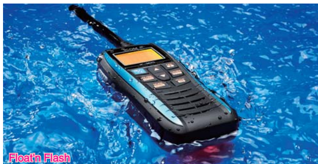
For illustration purpose only.